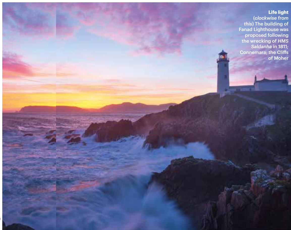
Life light (clockwise from this) The building of Fanad Lighthouse was proposed following the wrecking of HMS Saldanha in 1811; Connemara; the Cliffs of Moher