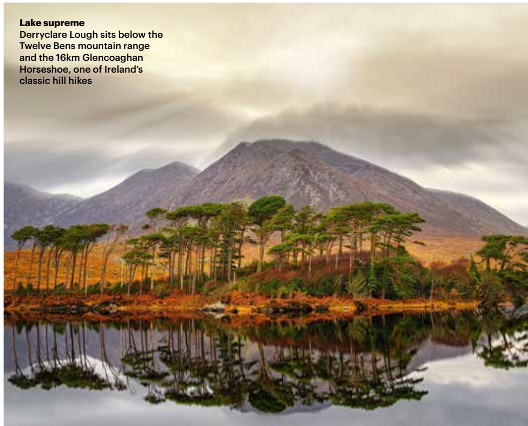
Lake supreme Derryclare Lough sits below the Twelve Bens mountain range and the 16km Glencoaghan Horseshoe, one of Ireland's classic hill hikes