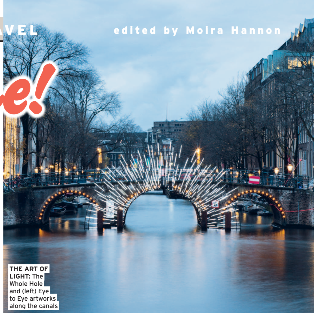
THE ART OF LIGHT: The Whole Hole and (left) Eye to Eye artworks along the canals

7) After a day at one of the big museums (the Rijksmuseum, Van Gogh Museum