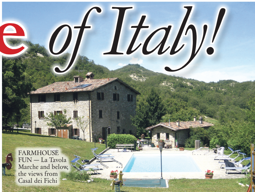
FARMHOUSE FUN — La Tavola Marche and below, the views from Casal dei Fichi

Soon we were tucking into broad bean crostini, stuffed aubergine and roast veal at