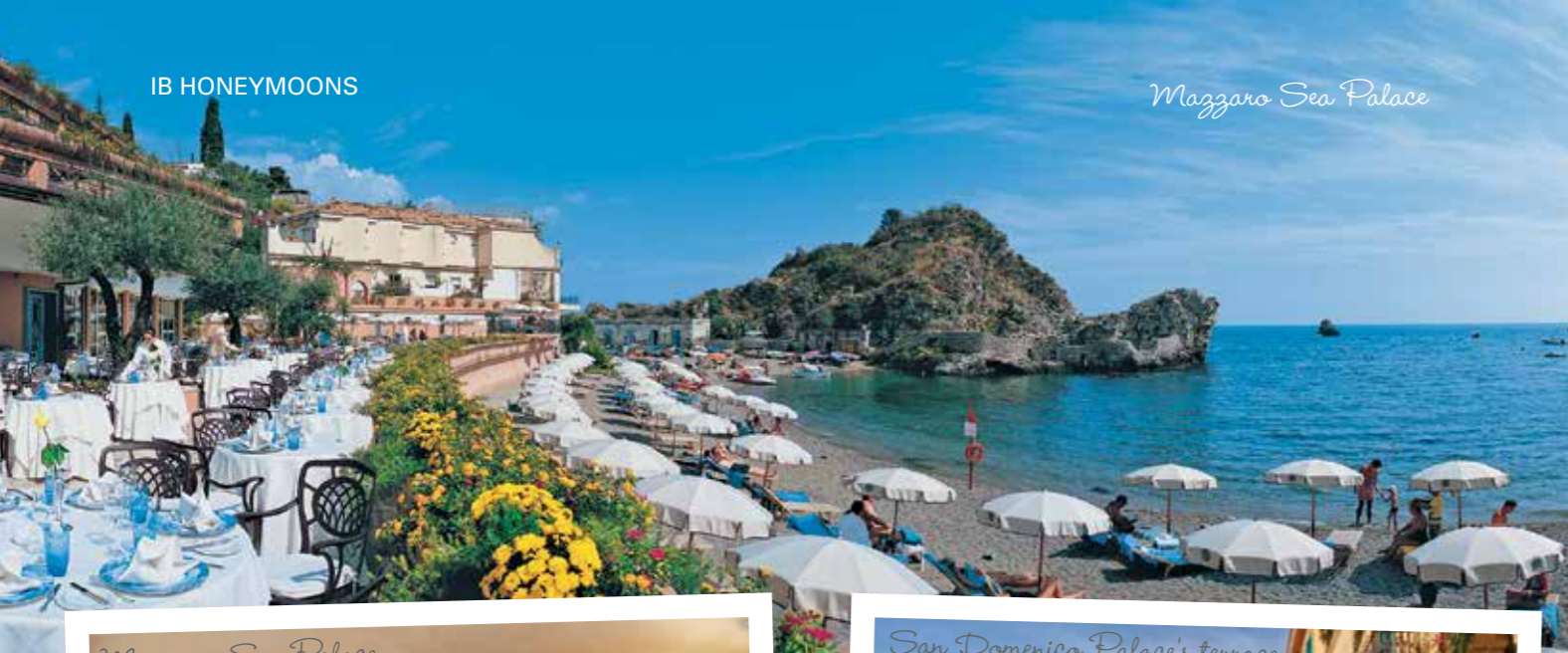
Mazzaro Sea Palace