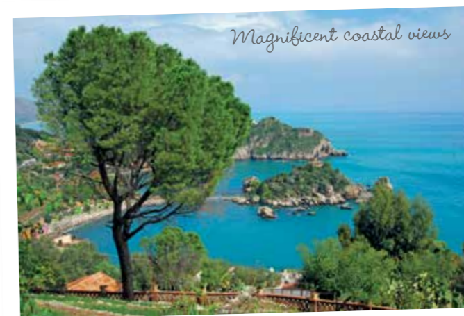
Magnificent coastal views

Enjoy a leisurely walk up to the village of Castlemola, high above Taormina, for a long lunch and a bottle of local wine at a traditional Sicilian restaurant before browsing the shops or retiring back to your hotel pool for the afternoon. The 5km walk takes about an hour – or take a taxi up and walk back. A more energetic experience is to climb up Mount Tauro (378m), which takes about half an hour and has some steep steps towards the top – but you'll be rewarded with views down over Taormina, the Teatro Greco and the bay. There is a signposted path from Via Circonvallazione. The Taormina area has lots of other hiking trails, for all levels and all with rewarding views.