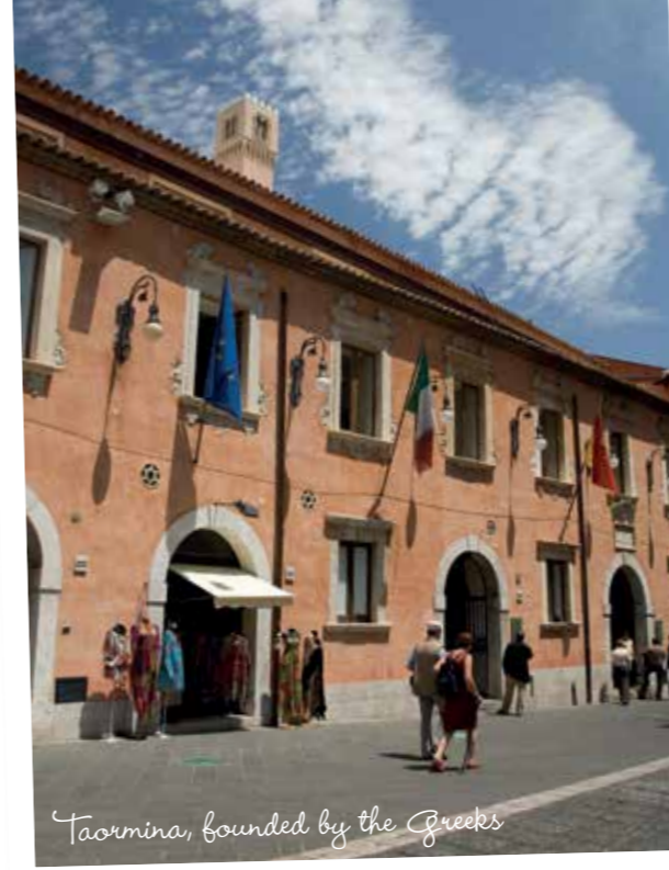
Taormina, founded by the Greeks

With its central Mediterranean position, Sicily is a cultural hotspot having seen invaders from many different people – starting with the Greeks, and followed by the Romans, Byzantines, Arabs, Normans, Swabians, French and Spanish, all who have left behind their mark in everything from architecture to food. Drop into Taormina's Teatro Greco, which dates back to the 3rd century BC and was later transformed by the Romans into an amphitheatre for their gladiator shows. You can still see live performances here – you might catch an arts or film festival during your visit – and what a setting, with views over the sea, mountains and Mount Etna. Along the via Teatro Greco you'll find the perfect art, ceramics and local Sicilian crafts to take home as honeymoon souvenirs.