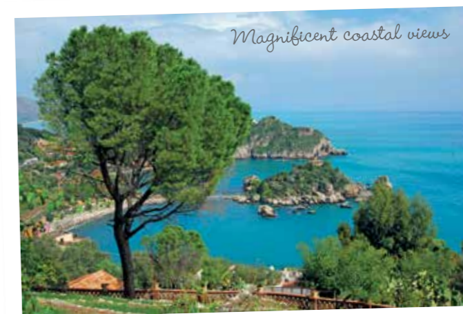
Magnificent coastal views

Enjoy a leisurely walk up to the village of Castlemola, high above Taormina, for a long lunch and a bottle of local wine at a traditional Sicilian restaurant before browsing the shops or retiring back to your hotel pool for the afternoon. The 5km walk takes about an hour – or take a taxi up and walk back. A more energetic experience is to climb up Mount Tauro (378m), which takes about half an hour and has some steep steps towards the top – but you'll be rewarded with views down over Taormina, the Teatro Greco and the bay. There is a signposted path from Via Circonvallazione. The Taormina area has lots of other hiking trails, for all levels and all with rewarding views.