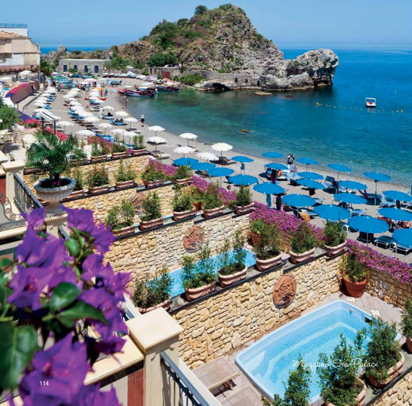
Mazgano Sea Palace