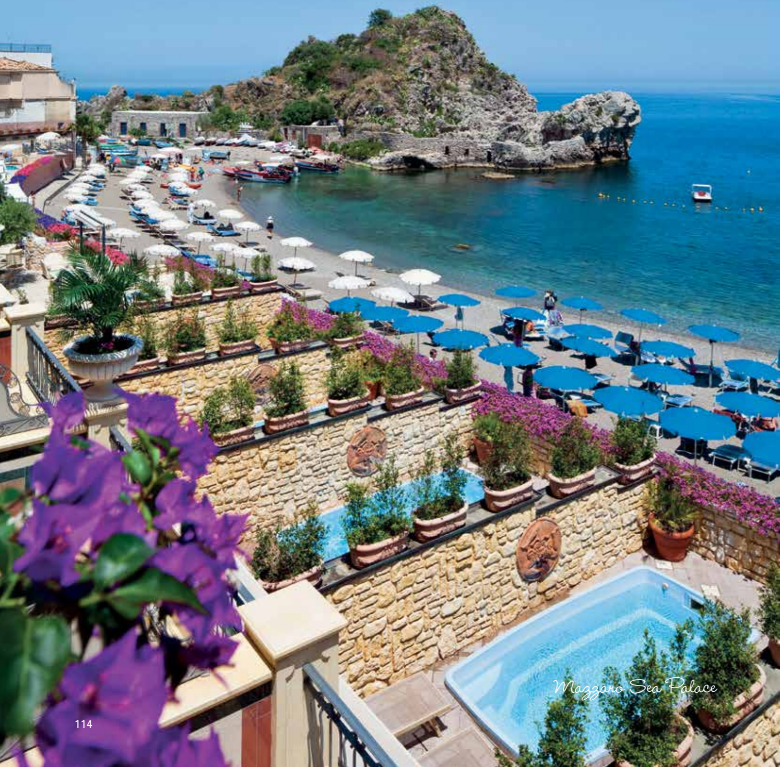
Mazgano Sea Palace