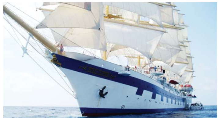
Clockwise from above left: the Orient Express, the Cliff House Hotel in Waterford and the Star Clipper

opened at the start of the month with a 'his and hers' twin treatment room boasting panoramic view over Ardmore Bay. The room is situated beside the Cliff House's twin outdoor seaweed baths.