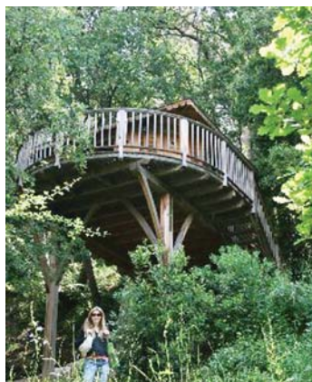
Top: Porer Lighthouse in Croatia; above: Orion treehouse on the French Riviera, and Prendiparte Tower in Bologna

Nice start from €40.99 one-way including taxes and charges; see ryanair.com . Aer Lingus flights from Cork to Nice start on 27 March and from Dublin to Nice start on 25 April, from €55.99 one way including taxes and charges; see aerlingus.com .