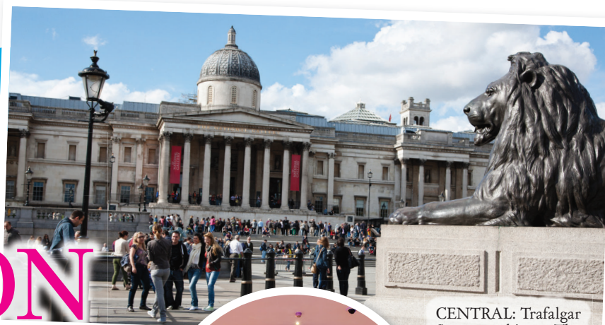
CENTRAL: Trafalgar Square and inset, The Strand Palace Hotel

YVONNE GORDON finds the perfect base for a city break