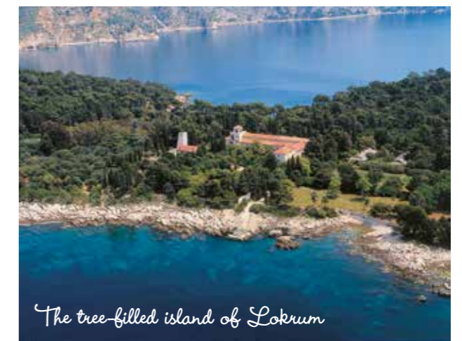
The tree-filled island of Lokrum

One of the best ways to start exploring the Old Town is to walk around the city walls, one of the best preserved