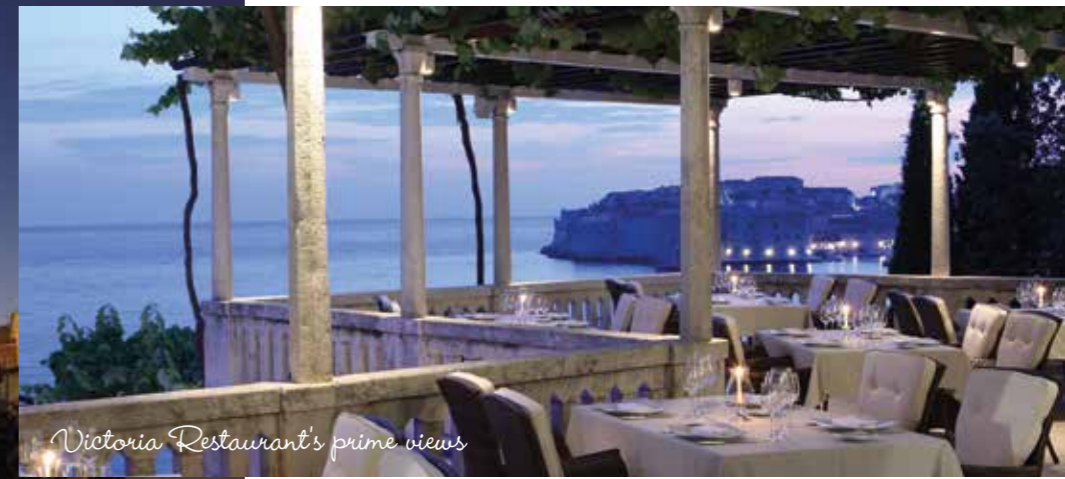
Victoria Restaurant's prime views