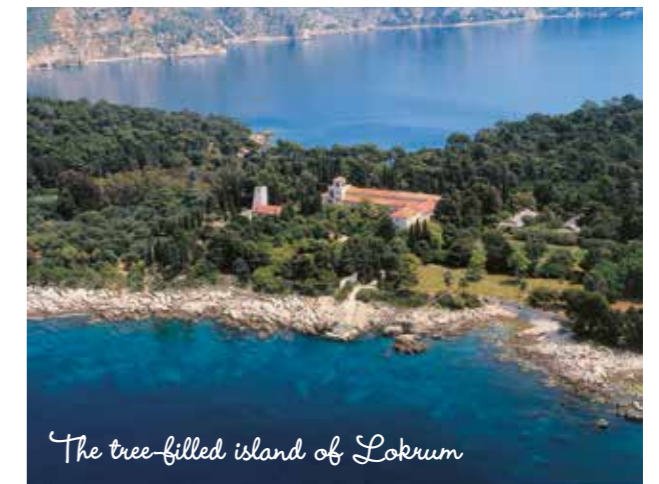
The tree-filled island of Lokrum

One of the best ways to start exploring the Old Town is to walk around the city walls, one of the best preserved