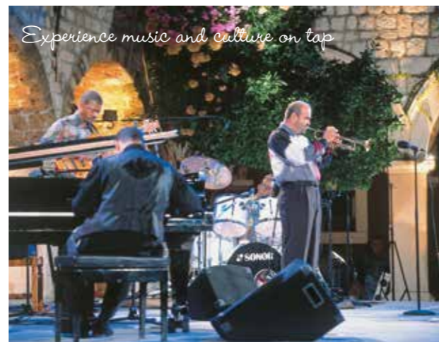
Experience music and culture on tap

Dating back to the 7th century, the former maritime republic has a rich culture of art, architecture and music. By day, spend a few hours exploring the palaces, churches, art galleries and museums, many of which were built during the city's wealthy Golden Age in the 16th and 17th centuries. They are set around a warren of stone backstreets, full of taverns, souvenir shops and pretty stone residences with colourful flower balconies.