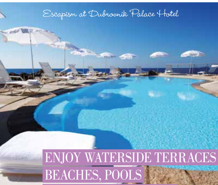
Escapism at Dubrovnik Palace Hotel

Whether you fall for the charm and atmosphere of the medieval walled town, the Adriatic's crystal clear waters, rocky coves and warm climate, or the luxury of one of the beautiful hotels, a honeymoon in Dubrovnik will be full of magic and romance.