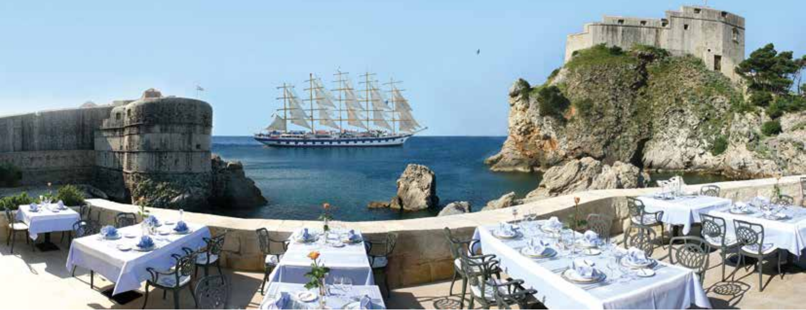
Alfresco dining at Restaurant Nautika

By day, Dubrovnik Old Town can be busy but at night, when the cruise ship tourists have gone home, the city takes on a more magical and romantic atmosphere. People dress up to eat outdoors in one of the old squares or a cosy tavern, or to enjoy an outdoor music or theatre performance.