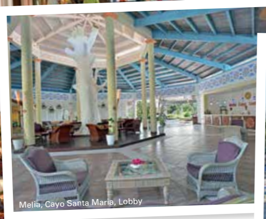
Melia, Cayo Santa Maria, Lobby