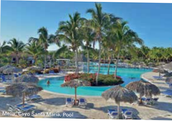
Melia, Cayo Santa Maria, Pool

square, where old people often gather to chat or smoke a cigar. The square is also home to a church which was built in 1550 which is worth seeing for its beautiful gold altar and ornate cedar ceiling.