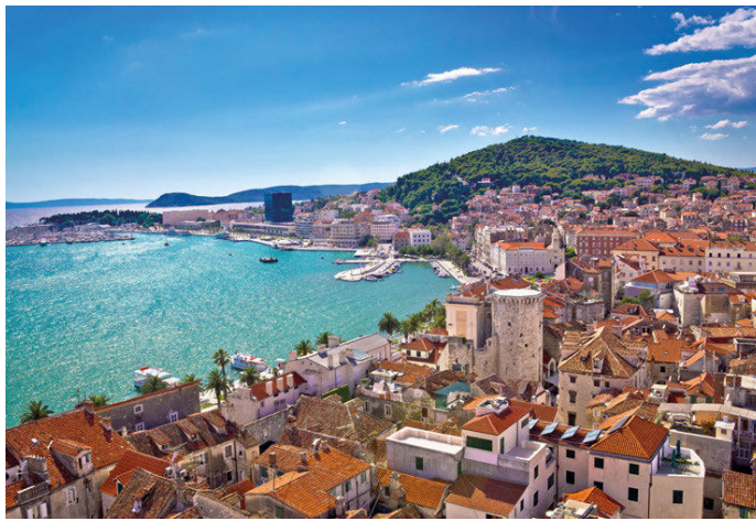
Clockwise from above, the city stretches out beneath St Dominus Cathedral; a quiet courtyard in the city centre; and an expansive room at the Palace Judita Heritage Hotel.